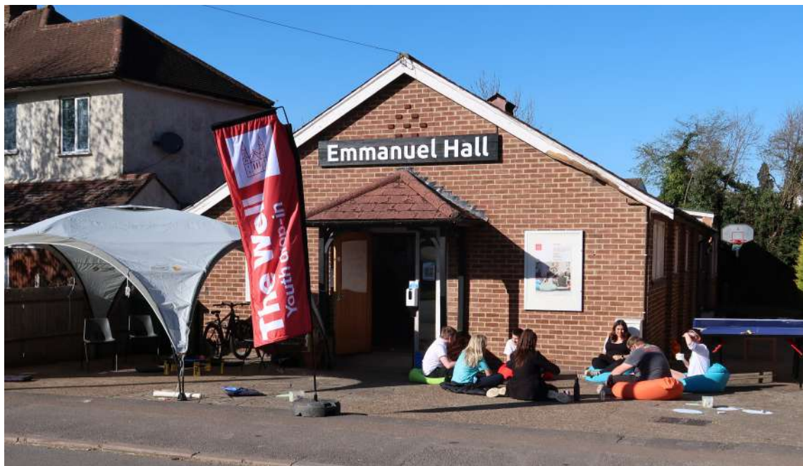
Emmanuel Hall: extensive improvements have created a vibrant space

Originally open one day a week, it has since expanded to three days – Monday, Wednesday and Thursday – from 3.30-6pm throughout the school term.