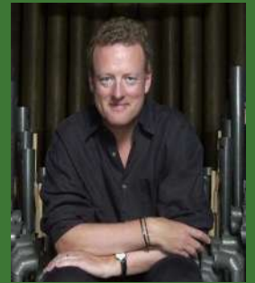
Howard Goodall, composer

Tickets will be available on the door, or book in advance by emailing secretary@claygatechoralsociety.co.uk or visiting www.claygatechoralsociety.co.uk .