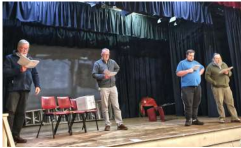
Cast members begin rehearsals