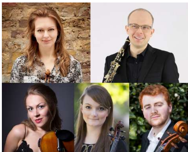
Ensemble Mirage: clarinet quintets

Membership fees are now reduced as the end of the season approaches. Contact the Membership Secretary on 020 8398 4377 .